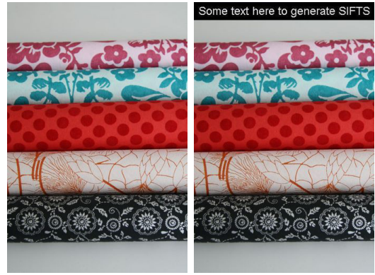
Fig. 2. Original & modified images

To demonstrate the feasibility of attacking the database part of CBIR systems, we show it is possible to conceal copies when the internals of the retrieval process is known. In this