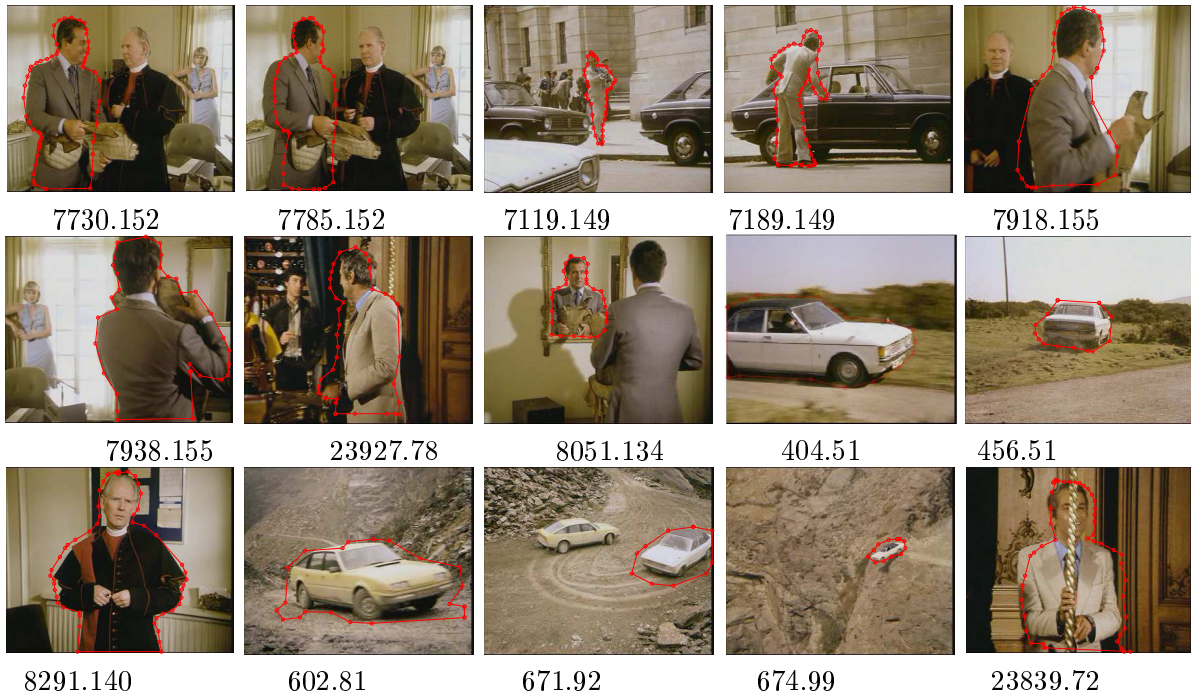
Figure 2: Subset of the “Avengers” object database

where |\cdot| is the determinant. The first term in this expression, B1 , is similar to the well-known Mahalanobis distance and measures the distance between the two populations caused by the mean shift. The second term B2 gives class separability due to the covariance-difference.