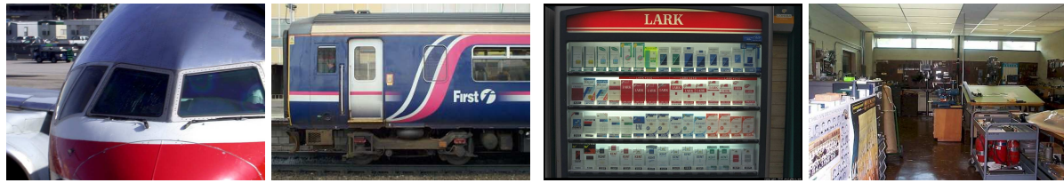
(a) true positives