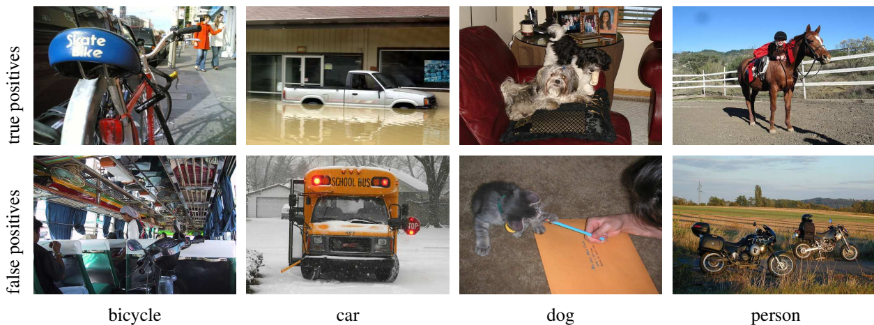
Figure 1. Sample PASCAL VOC'06 images classified with our semantic hierarchic classifier.

experimental section, incorporating the semantics into the knowledge representation leads to better recognition accuracy than relying only on straightforward reasoning, as it also allows to discover additional visual cues that would be missed otherwise. Semantic hierarchies have proved to be useful for automatic image annotation [14]. We use them to combine discriminative classifiers and thus choose a different strategy for exploiting their structure. We will demonstrate that this introduces some additional features for object detection, in particular it allows to give sensible answers in situations of uncertainty and to learn new classifiers using inference. We also go beyond the ISA relationships taking advantage of PARTOF and MEMBEROF relationships.