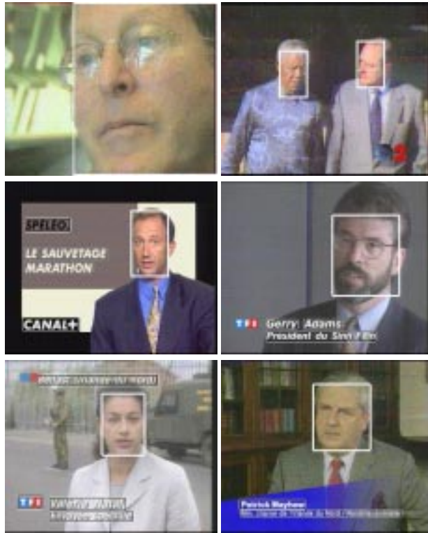
Figure2. Some results of face and text detection.

and size of detected faces may characterize a big audience (multiple faces), an interview (two medium size faces) or a close-up view of a speaker (a large size face). Location and size of text areas helps in characterizing the video content especially in news. In this section, we explain in more details how such shot classes can be defined, and their instances recognized automatically, in a DL framework.