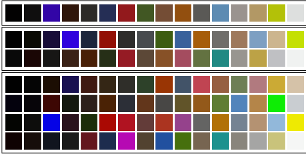
Figure 1: Color dictionaries learned by our procedure for k_c = 16, 32, 64 . Best viewed in color.

Lab 1 color space in all our methods. This space is preferred to, e.g., the opponent space because it is more consistent with the Euclidean space structure, in particular the color dictionary generation procedure, which is based on k-means.