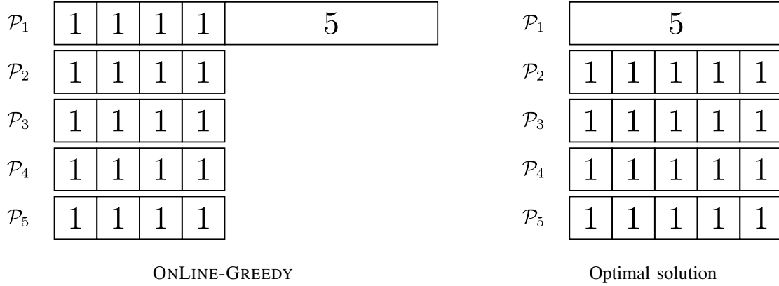
Figure 1. Tight instance for ONLINE-GREEDY (with p = 5 ).