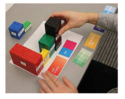
Figure 5: manipulating blocks and cards on sensor.