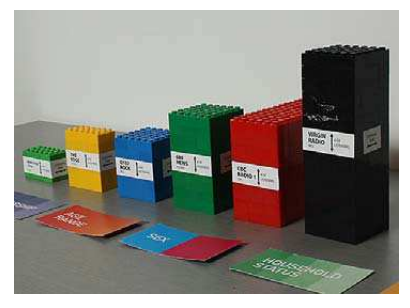
Figure 2: The data-sculpture set of blocks (data sculpture + TUI). Prototype of tangible interface and data sculpture representing six radio stations. The height of the block represents the number of listeners and the depth of the block represents the total time listened .