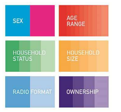
Figure 3: Prototype of interactive data category cards

The user interaction of the low fidelity prototypes was simulated using a Wizard of Oz technique.<sup>2</sup> Participants were also asked to complete a post-study survey.