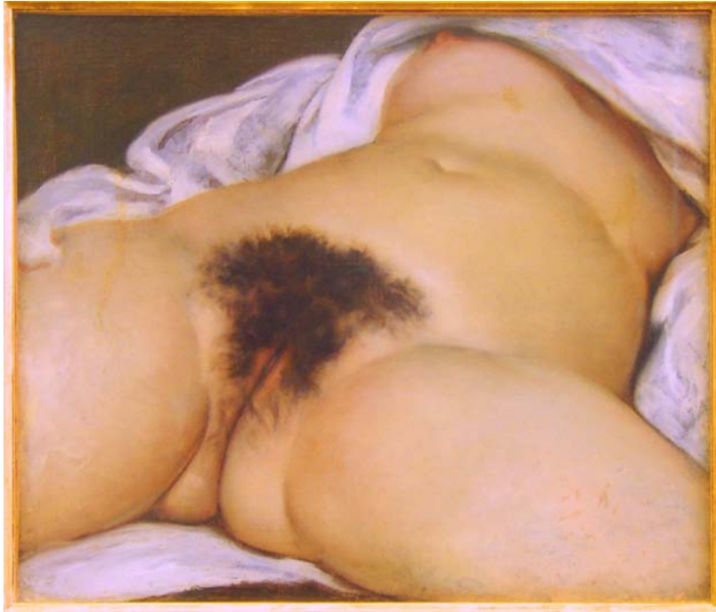
Illustration 7: Gustave Courbet, The Origin of the World (1866) Musée d'Orsay, Paris.