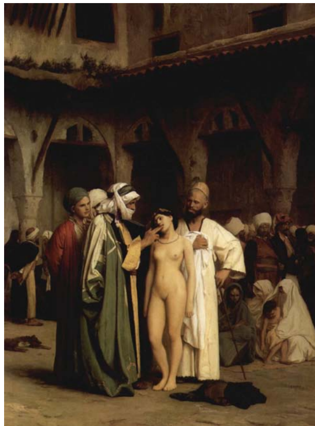
Illustration 4: Jean-Léon Gérôme, Slave Market (1866). Sterling and Francine Clarke Institute, Williamstown (Massachusetts). Painting exhibited at the Salon in 1867.