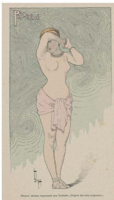
Illustration 2: Phryne ; tableau vivant at the Tuileries. Water colour by Léon Lebègue, for Pierre de Lano, Les Bals travestis et les tableaux vivants sous le Second Empire, Paris, H. Simonis Empis éditeur, 1893.