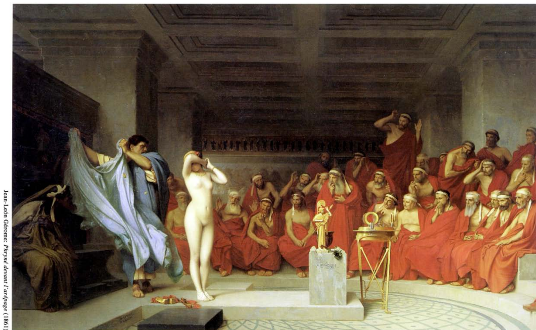
Jean-Léon Gérôme: Phryne devant l'aréopage (1861)