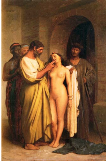
Illustration 3: Jean-Léon Gérôme, Purchase of a Slave (1857) Special collection.