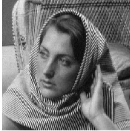
Figure 1: Barbara image

Hence (u_0, v_0) is a solution of problem (4.34). And as we have assumed that problem (4.34) has a unique solution, we deduce that (u_0, v_0) = (\hat{u}, \hat{v}) , i.e. (u_0, v_0) is the solution of problem (4.34). ■