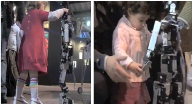
Fig. 4: Demonstration of Acroban during the Futuro Remoto exhibition in Napoli 2009. Children physically interacted with the robot provoking human-like mechanical responses of Acroban.

While demonstrating Acroban during public exhibitions such as Futuro Remoto (Napoli 2009) or Siggraph (Los Angeles 2010), we have discovered that it provokes spontaneous highly positive emotional reactions. Yet, as opposed to many other robots, its morphology is neither roundish nor cute. Even if we have not yet conducted thorough studies, we have formulated hypotheses to try to explain those reactions.