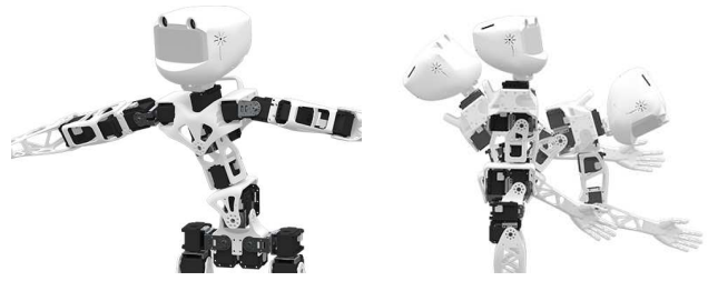
Fig. 2: These figures illustrate some morphological features of the Poppy humanoid Robot: Poppy has an articulated trunk of 5 DoFs which allows more natural and fluid motions while improving the user experience during physical interaction and actively participating to the balance of the robot.

Small feet with compliant toes: To produce an efficient and human-like walking gait, Poppy's feet design takes some functional inspiration from the actual human foot such as the proportion (i.e. small compared to conventional humanoids), compliance and toes which are key features concerning both the human walking [22] and biped robots with a human-like gait [23].