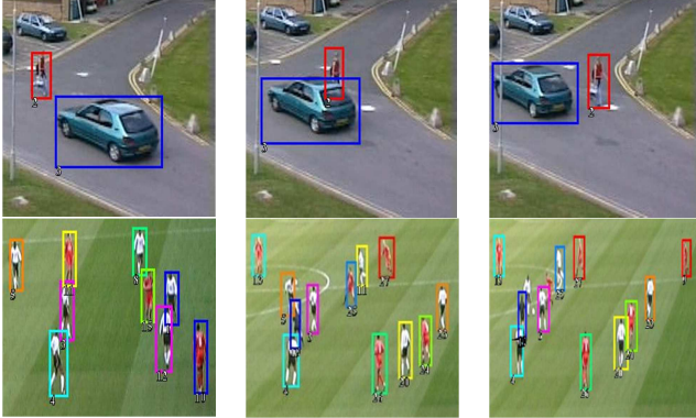
Figure 2: Partial and full occlusion management

The improvements of our feature detection and selection approach are illustrated in Figure 2.