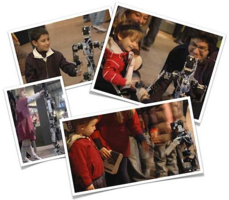
Fig. 1. Robust and playful physical child-robot interaction with Acroban. Around 150 children personally and continuously interacted with Acroban during a whole week-end in a public space in Citta della Scienza, Napoli, Italy.

http://www.youtube.com/watch?v=gKEjkckxzBU