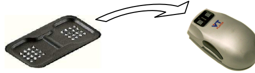
Fig. 1. VTPlayer mouse, with two 4×4 pins matrices on the top