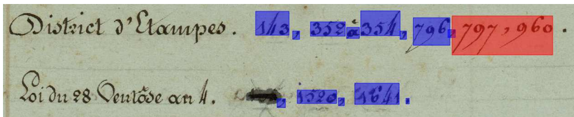
Figure 1. Number and separator detection automatically produced for an excerpt from a page of a document dating from the 18 th century. On the first line, a separator was missed and caused the under-segmentation of the two last numbers.

Document analysis and recognition systems often fail to produce results with a sufficient quality level when processing old and damaged document sets, and require manual corrections by human operators to improve results. While most systems tend to rely on human interaction during post-processing stage, it is clear that the ability to interact with such automatic system during the analysis, and not after, can be valuable. For instance, in Fig. 1, our goal was to localize sales numbers, and segment them using separators we detected, then recognize them, optimize recognition results using the fact that, for each line, numbers are in increasing order, and associate the resulting number list to the sale name written on the left (previously recognized) in a database entry. When a separator (a coma here) is missed, a human operator can simply indicate the position of the missing separator at the right time so as to avoid the need for manual correction of subsequent errors in the final document structure, which would require costlier edition actions: localize each number, key its value, etc.