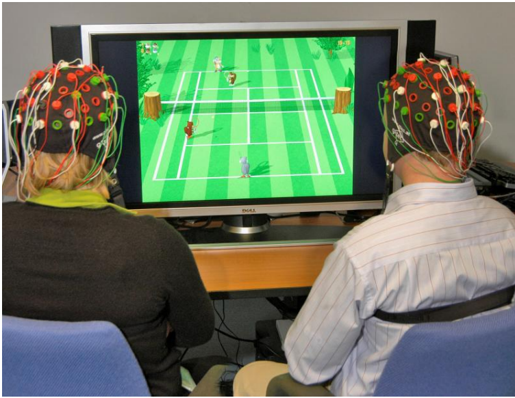
Fig. 2. Gaming is considered an important application area of non-medical BCIs. Brain control results in the development of new games but can also add to the fun factor of existing games.