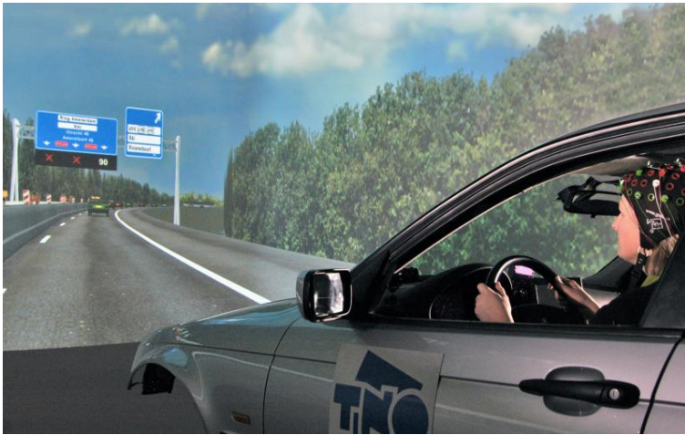
Fig. 3. Brain signals can be used to monitor for instance driver workload or to evaluate in-vehicle systems that may interfere with the primary driving task.