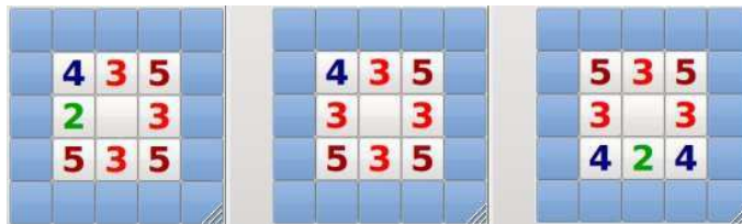
Fig. 3. The Gnomine version of the 5x5 board with 15 mines is a sure win: on each of these figures, one can deduce the position of all mines (there is only one non-mine location). This covers all possible cases by rotation.

Given the rules only (no expert knowledge added), our algorithm asymptotically finds the best move, and in 5x5 with 15 mines and gnomine rules it finds it in 5 seconds (in all runs among 500 runs).