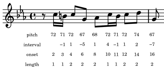
Figure 1. A monophonic series of notes (start of Fugue #2, see Figure 4), represented by (p, o, \ell) or (\Delta p, o, \ell) triplets. In this example, onsets and lengths are counted in sixteenthths, and pitches and intervals are counted in semitones through the MIDI standard.

A note x is described by a triplet (p, o, \ell) , where p is the pitch, o the onset, and \ell the length. The pitches can describe diatonic (based on note names) or semitone information. We consider ordered series of notes x_1 \dots x_m , that is x_1 = (p_1, o_1, \ell_1), \dots, x_m = (p_m, o_m, \ell_m) , where 1 \leq o_1 \leq o_2 \leq \dots \leq o_m (see Figure 1). The series is monophonic if there are never two notes sounding at the same onset, that is, for every i with 1 \leq i < m , o_i + \ell_i \leq o_{i+1} . To be able to match transposed patterns, we consider relative pitches, also called intervals : the interval series is defined as \Delta x_2 \dots \Delta x_m , where \Delta x_i = (\Delta p_i, o_i, \ell_i) and \Delta p_i = p_i - p_{i-1} .