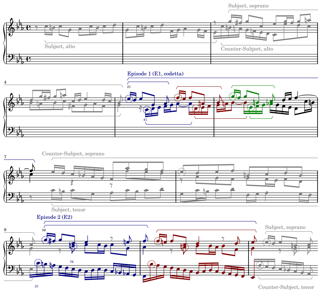
Figure 4. Start of Fugue #2 in C minor (BWV 847), showing the ground truth for the first two episodes. Non-episodic parts are grayed. The notes starting the initial patterns and the occurrences of the sequences are circled.