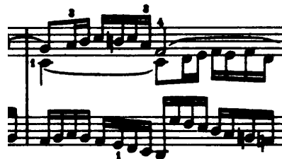
Figure 5. Partial sequence with a change of voices: the pattern is heard at the soprano, then, transposed, at the alto (measure 24 of Fugue #2).