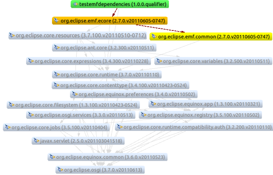
Fig. 2. Dependencies for each new metamodel generated code