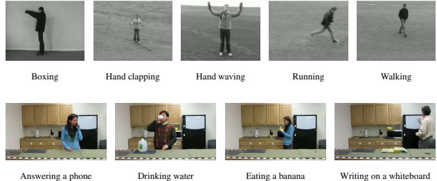
Figure 2: Sample frames from video sequences of the KTH (first row) and ADL (second row) datasets.

In order to quantize local features, we use the k -means clustering technique and nearest neighbour algorithm. To compute the bag-of-words representation, features are quantized to the codebook size of 1000, which has shown empirically to give good results. As a metric to calculate a distance between features and visual words, we use the L_2 norm. Since Harris3D corner detector calculates sparse spatio-temporal features, we set the weights w as w^{(x)} = 1 , w^{(y)} = 2 , w^{(t)} = 4 (Equation 5). To compute STOCF features, the HOG-HOF descriptors are quantized to small codebook sizes (10, 15, 20 and 25) and