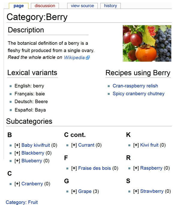
Figure 2. The Berry concept in WIKITAAABLE.

WIKITAAABLE is a semantic wiki that uses Semantic MediaWiki [11] as support for encoding knowledge associated to wiki pages. WIKITAAABLE contains the set of resources required by the TAAABLE reasoning system, in particular: an ontology of the domain of cooking, and recipes.