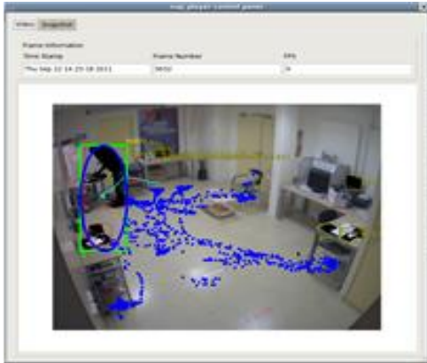
Figure 2. Multi-sensor activity recognition system screen. Rectangle envelope highlights the detection of a person in the scene. Blue dots represent previous positions of the detected person in the scene.

The vision component has been developed using a modular vision platform locally developed that allows the test of different algorithms for each step of the computer vision chain (e.g., video acquisition, image segmentation, physical objects detection, physical objects tracking, actor identification, and actor events detection). The vision component extracts the objects to track from the current frame using an extension of the Gaussian Mixture Model algorithm for background subtraction [26]. People tracking is performed by a multi-feature tracking algorithm presented in [20], using the following features: 2D size, 3D displacement, color histogram, and dominant color. Fig. 2 shows an example of the vision component output. Rectangle envelope highlights the detection of a person in the scene. Blue dots represent previous positions of the detected person in the scene.