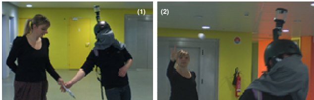
Figure 6: Two illustrative scenarios. (1) Catching a stick out of the natural field of view, (2) avoiding a ball thrown from behind.

The main discomfort came from the unbalanced weight of the headset (helmet, camera, optics and HMD: 1650g). Future work is of course necessary now to evaluate the learning process, user perception, and the potential exploitation of 360° vision in various tasks, which is not the focus of this paper.