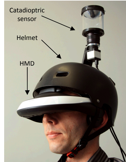
Figure 1: FlyVIZ prototype and proof-of-concept.

Copyright 2012 ACM 978-1-4503-1469-5/12/12...$15.00.