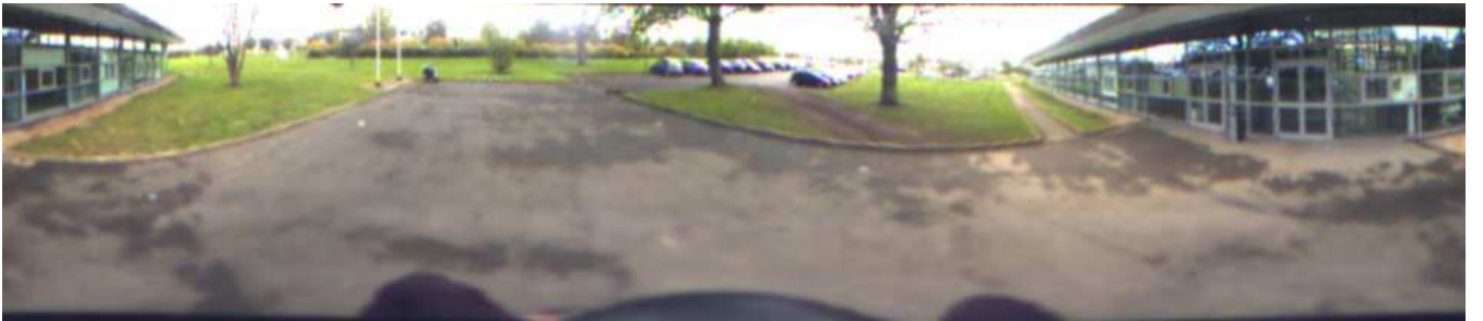
Figure 4: Image displayed in the HMD corresponding to the transformation of the raw image of Figure 3.

During these tests, users get used within the first 15 minutes of practice, letting them to smoothly move in their environment. Users also get used to the new visual feedback loop of their arms and hands, letting them open doors or grasp objects. In these cases, depth perception is altered since binocular vision is not available, but as suggested by Cutting [13], users seem to be able to base depth evaluation on the other depth cues (motion parallaxes, etc.). For the main user, a first scenario consists in grasping an object (a stick) held out by another person. Without moving his/her head, the user instantly perceives the position of the stick and can grab it, even when it is located out of his/her natural field of view. In a second scenario, the user is walking and must avoid some balls thrown at him/her, with balls sometimes being thrown from behind. A third scenario consists in driving a car on a parking lot, being able to see both the external environment and the car interior at the same time (Figure 5). During several tests, the device has been worn for more than an hour, without motion sickness or particular visual fatigue.