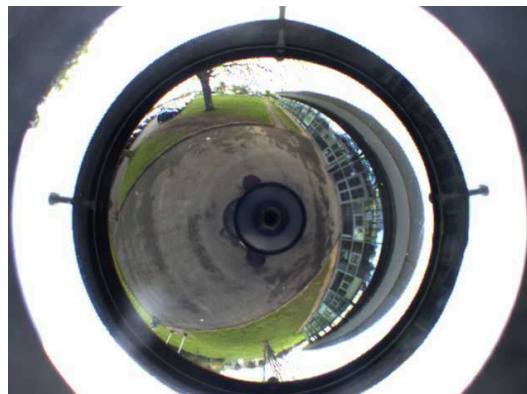
Figure 3: image provided by the Catadioptric system.

For the first projection, the mathematical formulation of the problem consists in mapping all the space directions onto a plane. Mapping one direction of the 3D space is equivalent to map a point from a unit sphere onto a plane [10]. This mapping problem (and its inverse problem) has been widely studied by mathematicians and cartographers [11]. We use the plate carrée cylindrical projection [11] (aka. the equirectangular projection) that is widely used both in cartography and panoramic imaging. Although the plate carrée projection generates some distortions at poles, it preserves the shapes along the 0° parallel. This is known