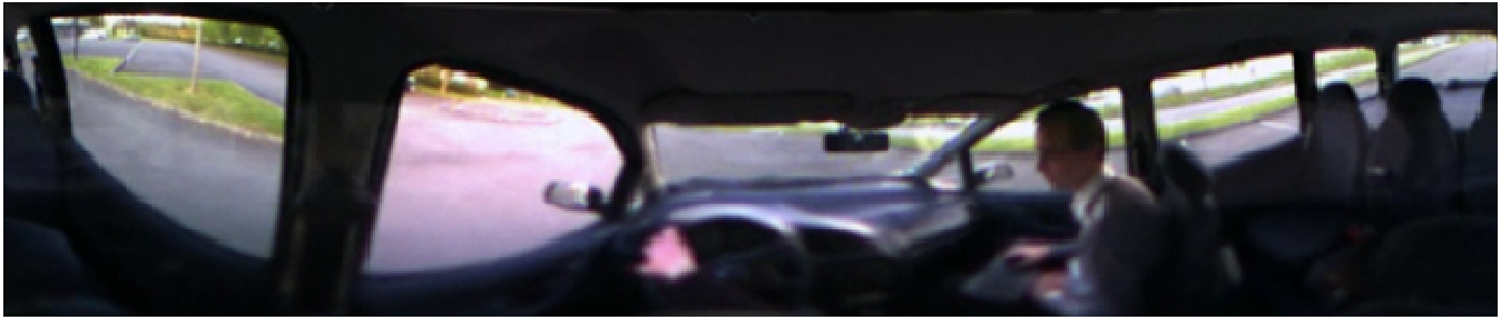
Figure 5: Third illustrative scenario: driving a car on a parking lot (HMD view).

The main discomfort came from the unbalanced weight of the headset (helmet, camera, optics and HMD: 1650g). Future work is of course necessary now to evaluate the learning process, user perception, and the potential exploitation of 360° vision in various tasks, which is not the focus of this paper.