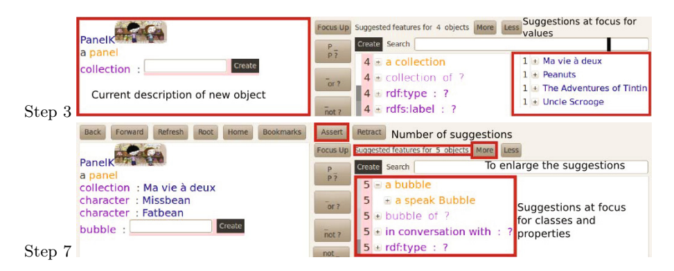
Fig. 8. UTILIS screen shots of steps 3 and 7 of PanelK creation