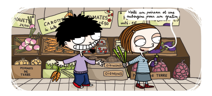
Fig. 6. Panel of Ma vie à deux : Pour le meilleur et pour le pire !, by Missbean, City Editions

:collection []. The upper part of Figure 8 shows the user interface for step 3, annotations in black have been made by hand, the current description is on the left side. On the right side, suggested resources for the focus are listed, here the collections. Above that area, the number of suggestions is indicated and a More button allows them to be expanded to larger distances containing results. At step 3, the user chooses \langle Ma \ vie \ \dot{a} \ deux \rangle among all the collections. Let us go back to Figure 7, at step 4 the description is \langle PanelK \rangle a :panel; :collection \langle Ma vie à deux>. The suggestions are the properties of at least one panel of Ma vie à deux. The property selected by the user is :character [] to specify characters of the new panel. At step 5, the suggestions are all the characters of the Ma vie à deux panels already annotated. The user selects \langle Missbean \rangle and \langle Fatbean \rangle . At step 6, the initial query, corresponding to the description, has no results. Indeed, those two characters do not appear together in any panel of the base vet. By relaxation, UTILIS makes suggestions to the user at distances 1 and 7. The lower part of Figure 8 shows the user interface of step 7, suggested classes and properties are in the middle part. From there on, the user can continue the description of the panel and when he decides that it is complete, he adds it to the base with the Assert button.