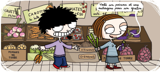
Fig. 6. Panel of Ma vie à deux : Pour le meilleur et pour le pire ! , by Missbean, City Editions

:collection []. The upper part of Figure 8 shows the user interface for step 3, annotations in black have been made by hand, the current description is on the left side. On the right side, suggested resources for the focus are listed, here the collections. Above that area, the number of suggestions is indicated and a More button allows them to be expanded to larger distances containing results. At step 3, the user chooses <Ma vie à deux> among all the collections. Let us go back to Figure 7, at step 4 the description is <PanelK> a :panel; :collection <Ma vie à deux> . The suggestions are the properties of at least one panel of Ma vie à deux . The property selected by the user is :character [] to specify characters of the new panel. At step 5, the suggestions are all the characters of the Ma vie à deux panels already annotated. The user selects <Missbean> and <Fatbean> . At step 6, the initial query, corresponding to the description, has no results. Indeed, those two characters do not appear together in any panel of the base yet. By relaxation, UTILIS makes suggestions to the user at distances 1 and 7. The lower part of Figure 8 shows the user interface of step 7, suggested classes and properties are in the middle part. From there on, the user can continue the description of the panel and when he decides that it is complete, he adds it to the base with the Assert button.