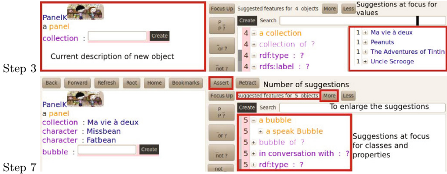
Fig. 8. UTILIS screen shots of steps 3 and 7 of PanelK creation