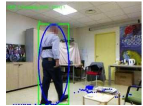
Figure 4. RGB-D cam. view