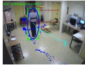
Figure 3. RGB cam. view

indicate the best of the ten test sets during the cross-validation. Figure 3 (Detection view of RGB camera) shows a “standing” detection example of the RGB camera which is fixed at a corner of the experimental room, and Figure 4 shows the detection view of the RGB-D camera at the same time instant.