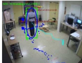
Figure 3. RGB cam. view

indicate the best of the ten test sets during the cross-validation. Figure 3 (Detection view of RGB camera) shows a “standing” detection example of the RGB camera which is fixed at a corner of the experimental room, and Figure 4 shows the detection view of the RGB-D camera at the same time instant.