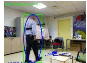
Figure 4. RGB-D cam. view