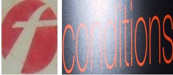
Figure 3. Images where auto-seeding fails

Although the proposed auto-seeding method performs satisfactorily well, it tends to fail in cases where Canny edge operator produces too many noisy or broken edges. In such cases some foreground regions are falsely marked as background and vice-versa, which leads to poor binarization. We show two such examples in Figure 3, where our auto-seeding algorithm fails to mark foreground-background regions appropriately.