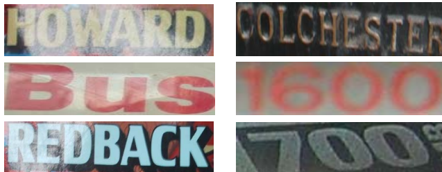
Figure 1. Some samples images we considered in this work

We, in this work, focus on binarization of natural scene text. Natural scene texts contain numerous degradations not usually present in machine printed ones such as uneven lighting, blur, complex background, perspective distortion, multiple colours etc. Methods such as interactive graph cut by Boykov et al. [2] and thereafter GrabCut [3] have shown promising performance in foreground/background segmentation of natural scenes in recent years. We formulate