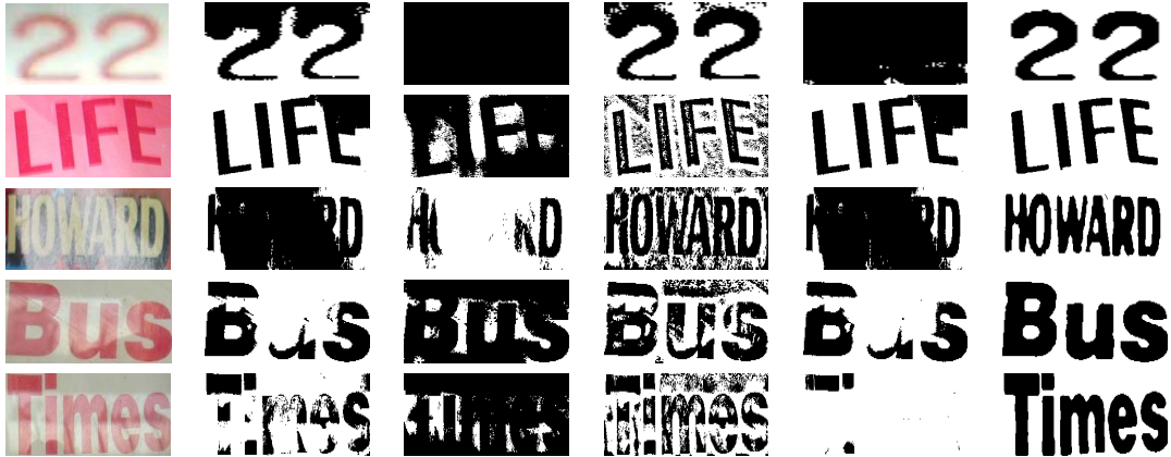
Figure 4. Comparison of thresholding based algorithms and the proposed method (From left to right Original, Otsu, Sauvola, Niblack, Kittler, Proposed (with edginess difference)).