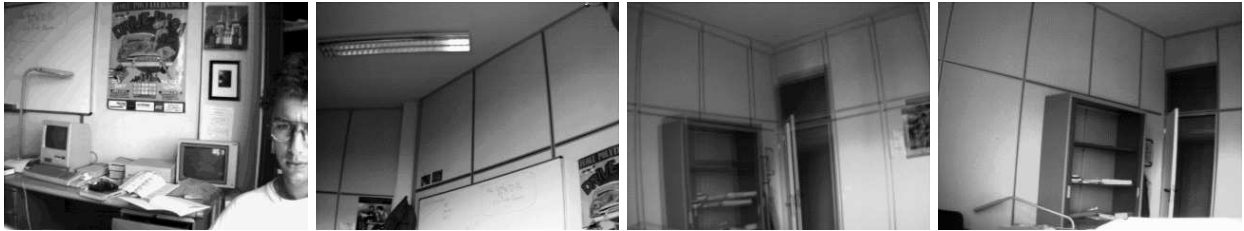
Figure 1: Some of the images that were used for distortion calibration.

The distortion calibration method was applied to sets of about 30 images (see Figure 1) for each camera/lens combination, and the results for the four parameters of distortion are shown in Table 1. The initial values for the distortion parameters before the optimization were set to “reasonable” values, i.e. the center of distortion was set to the center of the image, \kappa_1 was set to zero, and s_x to the image aspect ratio, computed for the camera specifications. For the IndyCam, this gave c_x = c_y = \frac{1}{2} , \kappa_1 = 0 and s_x = \frac{3}{4} .