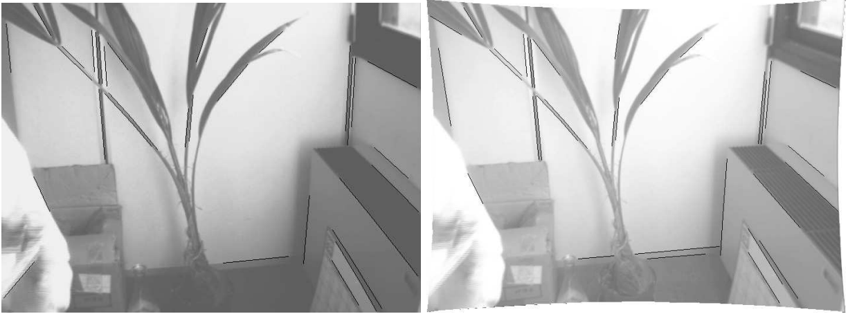
Figure 2: A distorted image with the detected segments (left) and the same image at the end of the distortion calibration with segments extracted from undistorted edges (right): some outliers were removed and longer segments are detected.