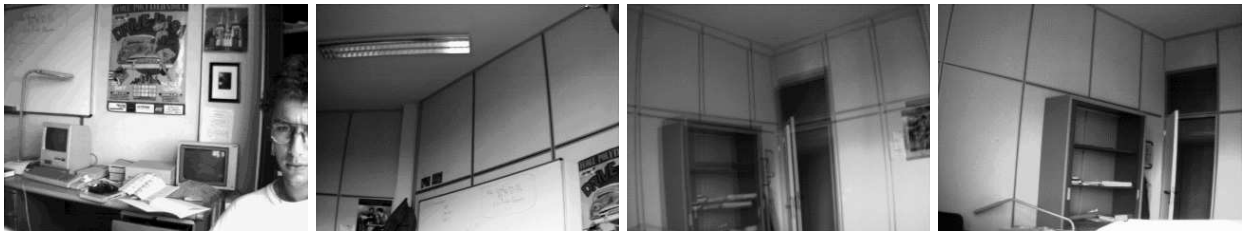
Figure 1: Some of the images that were used for distortion calibration.

The distortion calibration method was applied to sets of about 30 images (see Figure 1) for each camera/lens combination, and the results for the four parameters of distortion are shown in Table 1. The initial values for the distortion parameters before the optimization were set to “reasonable” values, i.e. the center of distortion was set to the center of the image, \kappa_1 was set to zero, and s_x to the image aspect ratio, computed for the camera specifications. For the IndyCam, this gave c_x = c_y = \frac{1}{2} , \kappa_1 = 0 and s_x = \frac{3}{4} .