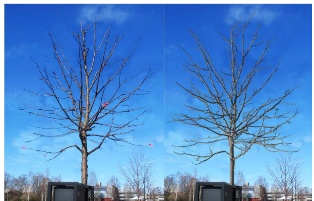
Fig. 1. Example of a lime tree reconstruction with the method of Preuksakarn et al. (2010). Left: an original picture of the tree. Right: the reconstructed virtual model inserted into same background.

While these methods produce realistic structures as shown by Fig. 1, no method to compare them quantitatively or evaluate their respective accuracy has been proposed so far. Such evaluation is of major importance for further exploitation of reconstructed models in biological applications. In this work, we address the problem of evaluating the accuracy of reconstructed structures from laser scanner data. For this, we first present a software tool that allows experts to define reconstruction from the point cloud. Using these expert-defined structures that will be considered as reference, we then propose different indices and algorithmic methods to quantify the similarities and differences between automatically reconstructed and reference structures. Such indices make it possible to compare the reconstructions made with the different methods proposed in the literature.