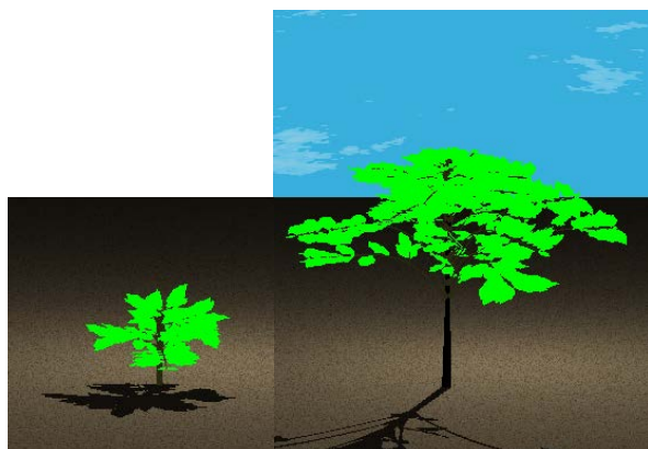
Fig. 2. Visualisations of juvenile and adult coffee plant mock-ups.

points below the plant crown and oriented to four cardinal points. LAI outputs correspond to the crown projected on soil (calculated from x- and y-axis projections). LAI of eight mock-ups fitted well to measured plants (bias = -0.07 and RMSE=0.338 at Fig. 1B). The measurements with LICOR 2000 were accepted when over- or underestimation was about 10% for coffee plants (Angelocci et al. 2008).