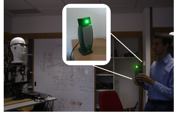
Fig. 2. Audio-visual device used to align the auditory and visual spaces. An LED light bulb is mounted onto a speaker which makes the visual localization more precise. White noise is played throughout the recording to improve the auditory localization.

The remainder of the paper is organized as follows. Section II describes the audio-visual alignment model. This leads to a maximum likelihood formulation and to an associated EM algorithm that is described in detail in Section III. Results obtained with simulated and real data are shown in Section IV. Section V concludes the paper along with a short discussion.