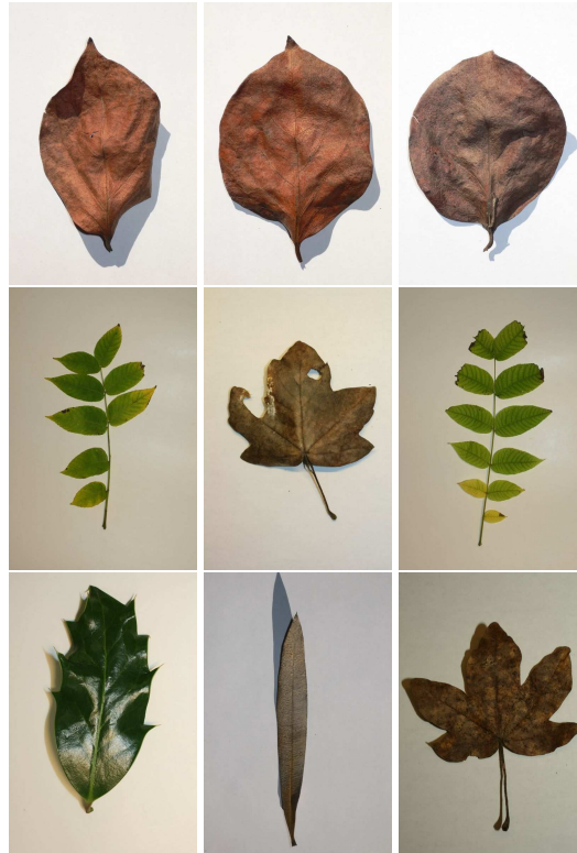
Fig. 3. Examples of scan-like images from the testing set of ImageCLEF 2011 dataset.

U : number of users (who have at least one image in the test data).