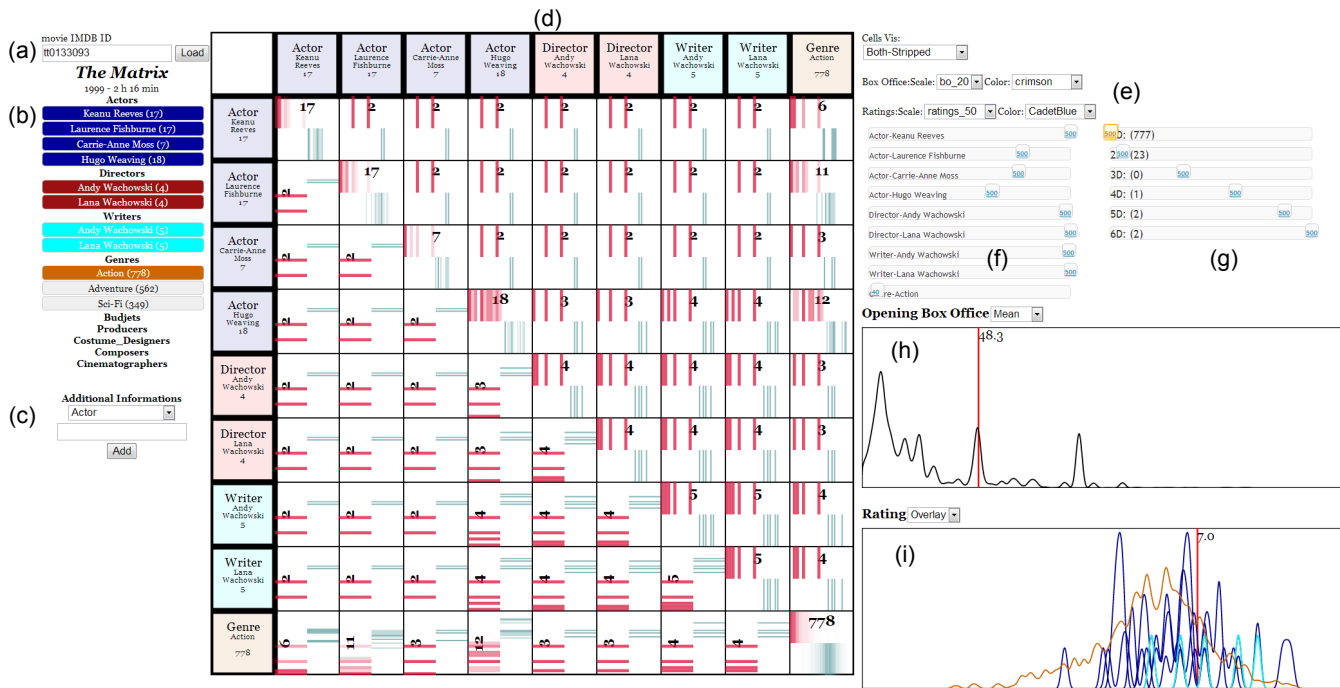
Fig. 2. CinemAviz interface: (a) Imdb unique ID input; (b) dimensions of the explored movie; (c) additional dimensions input; (d) matrix view; (e) matrix view visualization options; (f) sliders to weight each selected dimension; (g) sliders to weight movies according to the number of dimensions they have in common with the explored movie; (h) opening week box office prediction view; (i) user rating prediction view.

will often be stretched by dimensions with many movies. To give less importance to these dimensions, we visually weight the dimensions by observing the feedback in the views. Estimations are performed using the focus views, but going back and forth with the dimensions weighting step. Moving the mouse will trigger the inspector and display the value at the mouse position; the average value of the weighted dimensions is a vertical red line; brushing in the area makes a selection rectangle appear; and the average value within the brushed area is the vertical orange line at its center.