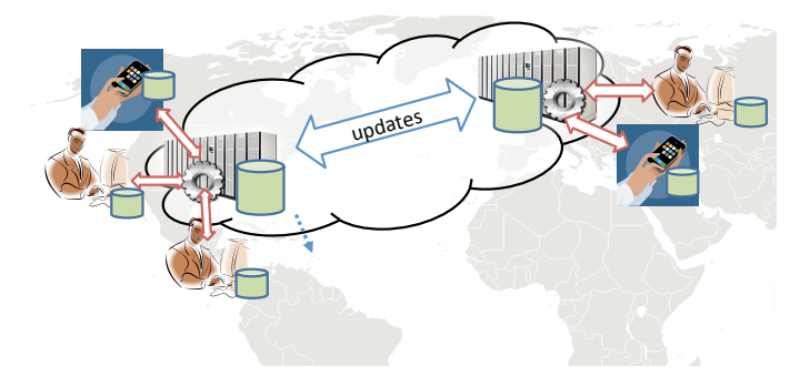
Figure. 1: Possible cloud-based system architecture.

propagated to all replica nodes to work correctly. These requirements can be achieved by using a large number of different protocols [17], [18], [19].