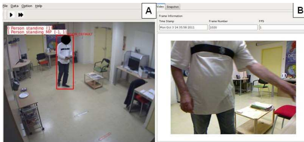
Figure 5. Scene point of the view in respect to the 2D RGB (A) and RGB-D (B) cameras.

The 2D RGB camera records video data from the top of one of the corners of the experimentation room, while the RGB-D camera records them from a lateral view of the scene. The lateral view is chosen as this camera placement on a position similar to the RGB camera would decrease its system performance on people detection. The decrease is due to the depth measurement become less reliable when the person moves farther than 4-5 m of the camera ( e.g. , on events at the back of the room). Figure 5 illustrates the differences in point of view of both cameras. The second part of the evaluation focuses on the evaluation of mid-term duration activities (IADLs).