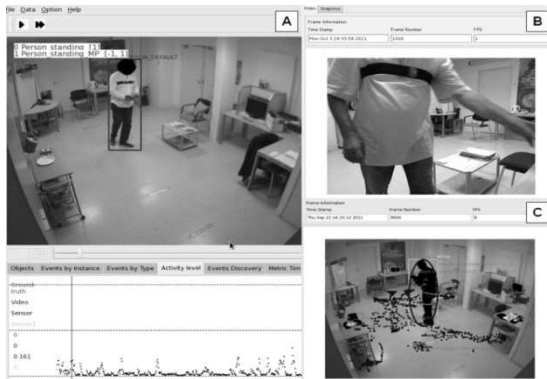
Figure 8. Participant' activity by the view point of different sensors: (A) RGB camera view and actimetry provided the inertial sensor (the bottom of image A); (B) RGB-D camera view of participant, which shows the inertial sensor worn by the participant; and (C) Drawn points on the ground represent the trajectory information of the participant during the experimentation.

Figure 8 shows the recording viewpoint of the RGB and RGB-D cameras in A and B, where WI sensor is visible at image B.