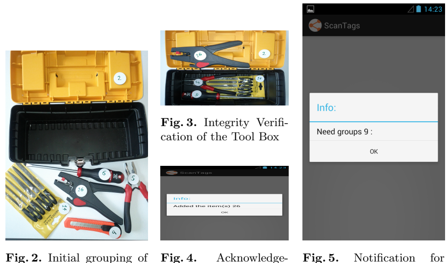
Fig. 2. Initial grouping of Tool Box and contents

We have developed a small android application to validate and verify the working of our current example. There is a subtle difference between the examples discussed presently with that in section 3. The group of tools in the toolbox strive to remain together throughout and our application tries to verify this situation which we referred to as an inference pro by nature in section 1. Our framework could be utilized for the current scenario but with a minor change. In our framework described in section 3, items are self described with it's own properties and the other's to which it would be incompatible. In this context, the idea is reversed for groups and algorithm 2 is modified accordingly. Figure 6 demonstrates the various phases of the application.