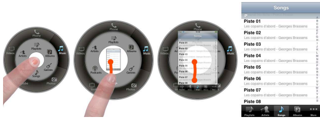
Figure 3: Long lists management: the linear list appears in the center of the Wavelet menu and is surrounded by its parent menus.

The Wavelet menu is an adaptation of the Wave menu for mobile devices. Our prototype has been designed to explore and navigate multimedia data. It thus appears in the center of the device screen (Figure 1) and contains five items corresponding to frequently used multimedia categories: Music, Photos, YouTube, Videos and Phone. More categories could be added if needed as the root menu can contain up to eight items. Second-level submenus contain three to six subcategories depending on the selected parent item. For instance, the Music category (Figure 2) is divided into: Albums, Music Styles, Songs, Podcasts, Artists, Playlists and Albums.