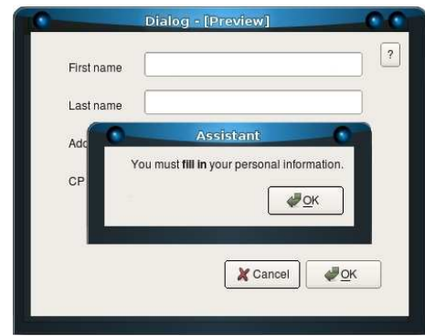
Figure 2. Help message derived from connections in Figure 1.

To support this method, we will supply designers with an editor in which tasks models and final UIs can be created. Both of them will coexist at the same time into the same workspace inside this editor. Once the task model and the final UI are represented, the designer will draw direct connections between elements of the task model and elements of the final UI, linking for instance, widgets with subtasks, as we can see in figure 1. Here, the task called Specify identity is visually connected to a group of widgets, containing two labels and two input fields. Then, the elementary task Specify first name which is also a subtask, is connected to a new subgroup of two widgets, one label and one input field.