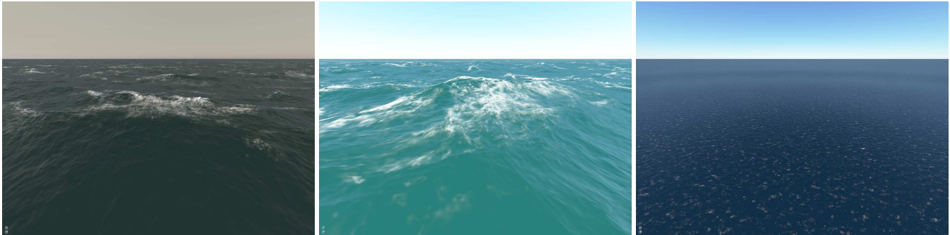
Figure 1: Some real-time results obtained with our method showing large ocean scenes with whitecaps under different wave and illumination conditions. The whitecap contribution is correctly averaged as the viewing distance increases.

INRIA Grenoble Rhône-Alpes, Université de Grenoble et CNRS, Laboratoire Jean Kuntzmann Université de Lyon, CNRS Université Lyon 1, LIRIS, UMR5205, F-69622, France