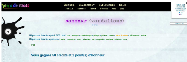
Figure 2: JeuxDeMots: recap of a game involving “casseur” (hooligan).

A galaxy of pseudo games (the definition is given in section 2.2.) were created around JeuxDeMots, including mainly LikeIt 1 , AskIt 2 or ColorIt 3 , that add information to the network. SexIt is one of them.