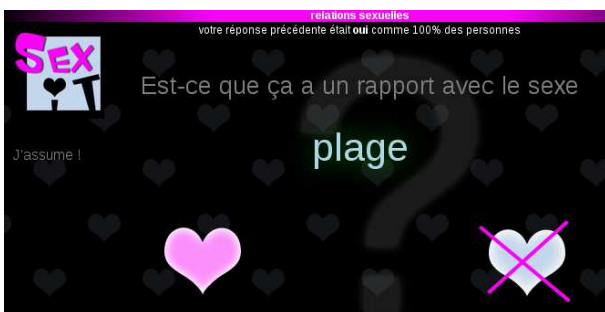
Figure 3: SexIt: is “beach” ( plage ) related to sex?

SexIt 5 allows players to identify a term as being related to sex or not (see an example in figure 3, for “beach”). It is a pseudo game : there is no score, no ranking, no gain, only a poll-like comparison with other players. It is played only because the topic is fun: we would have had more difficulties collecting data on taxation, for example. This is an important limitation for language resource building using that kind of interaction. Collecting information about vocabulary related to sex can be necessary, for example to detect pornographic contents. However, such information is insufficient for discriminating pornography from courses in biology, reproduction or anatomy which, while not being pornographic, contain their share of sex-related terms.