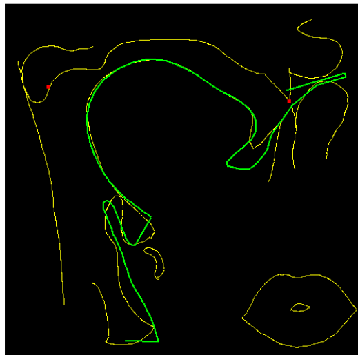
Figure 1: Fitting of the tongue model. A new speaker VT contours delineated by hand in yellow. Model contour in green. The larynx and the lip are also represented.

The evaluation of this adaptation procedure has been carried out on the corpus C3. The model has been adapted to the