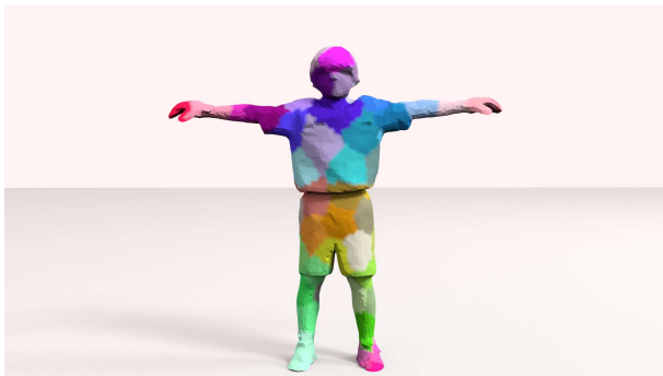
Fig. 1. Example of patch template used.

We assume given a temporal sequence of 3D reconstructions, incoherent meshes or point clouds, obtained using a multi-view reconstruction approach, e.g. [12,1,20]. We also assume that a template mesh model of the scene is available, e.g. a particular instance within the reconstructed sequence under consideration. The problem of local surface rigidity and mean pose analysis is then tackled through the simultaneous tracking and intrinsic parameter estimation of the template model. We embed intrinsic motion parameters (e.g. rigidities) in the model, which control the motion behavior of the object surface. This implies that the estimation algorithm is necessarily performed over a sub-sequence of frames, as opposed to most existing surface tracking methods which in effect implement tracking through iterated single-frame pose estimation. We first describe in details the geometric model (§3.1) illustrated with Fig. 1, and its associated average deformation parameterization for the observed surface (§3.2). Second, we describe how this surface generates noisy measurements with an appropriate Bayesian generative model (§3.3). We then show how to perform estimation over the sequence through Expectation-Maximization (§3.4).