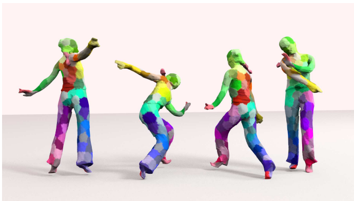
Fig. 4. Tracking excerpts from the DANCER dataset. Colors code patches.