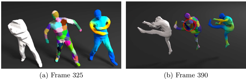
Fig. 3. Input mesh (left), tracked mesh with [9] (middle) and with our method (right).

Regarding limitations, the model may fall into local minima when the noise level of inputs is too high similarly to all patch-based methods but this was not a strong limitation on the datasets. As the model favours rigidity and isometric surface deformations, the surface sometimes overfolds in non-rigid sections (as sometimes seen in video), which we will address in future work.