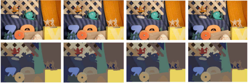
Figure 3: Results from the Army Men sequence. Notice the fine detail around the top-right gun figure.