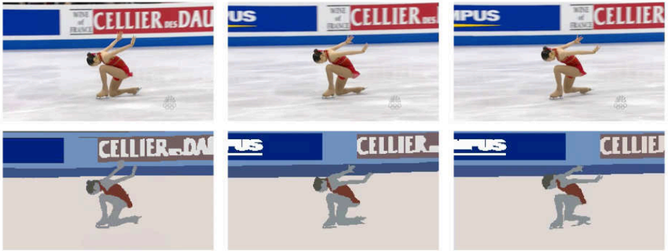
Figure 4: Results from Ice-skater Yu-Na Kim, 2009 World Championships, ©2009 NBC Olympics.

to achieve computational tractability and memory efficiency. Instead, we exploit the natural sparsity structure of the graph, and employ a low rank approximation of the Laplacian closely related to the Nyström method. We have found that sampling 30-50% of the pixels to index columns of the low rank approximation leads to comparable performance with a method that uses 100% of the columns. This strategy results in a spectral clustering method that can run on a single processor with the graph representation fitting in core memory. For instance, a 100 frame 640x480 sequence naively requires 6.8GB of memory, while with our method we are able to reduce this to 2.1GB and still retain accuracy. We have demonstrated the effectiveness of the approach on the Hopkins 155 data set, where we have achieved the best reported results for dense segmentation using an order of magnitude less computation than [16].