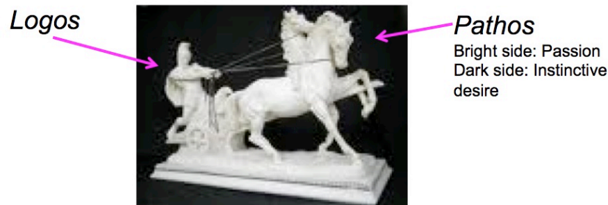
Fig. 2. Logos and pathos.