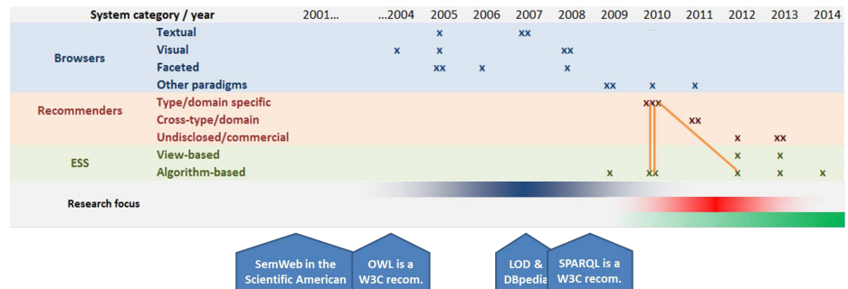
Fig. 2. Systems timeline