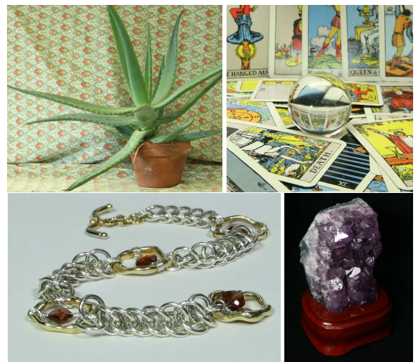
Fig. 2. Example images from the datasets: “aloe” from [14] and “tarot”, “bracelet” and “amethyst” from [15].

We have chosen to study 4 different weights for the blending factors. First we consider the “classic” weight ((1 - \alpha), \alpha) taking into account the “minimal angular deviation”. The second weight also fulfills this property. It is ((1 - \alpha)^2, \alpha^2) . The third chosen weight ignores the “minimal angular deviation” and assigns to each image the same weight. This is done independently of the \alpha value and the local deformation of the image transformation. The fourth weight is proportional to the local deformation of the transformation of the image, as described in [7], |\det D\tau|^{-1} . In our case \tau is the transformation given by the disparity and we compute its deformation with finite differences. In all 4 cases weights are normalized so that their sum is 1. If one of the two corresponding pixels is marked as invalid we assign a 0 weight to it, and a 1 weight to the other pixel. If both corresponding pixels are invalid, we mark the pixel as invalid. If one or both of the corresponding pixels are valid, we assign to the final pixel the weighted sum of the values. Notice that at this stage some pixels of the rendered image are labeled as invalid. We explain how we handle those cases in section 3.3.