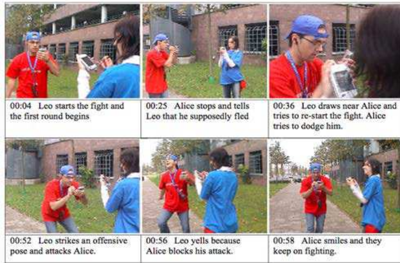
Fig. 3. The German fight

virtual level. The German players fought in an offensive, expressive manner. They pestered each other, and focused on both, the virtual and the real level, compare Table 1.