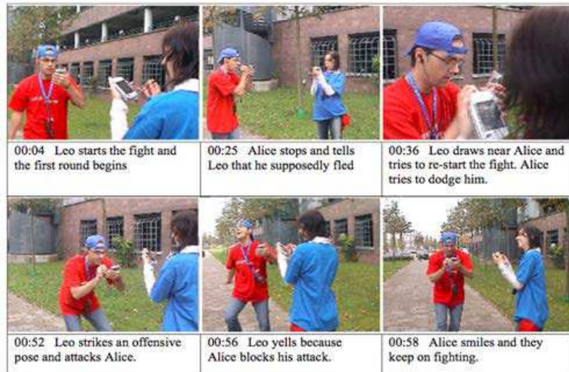
Fig. 3. The German fight

virtual level. The German players fought in an offensive, expressive manner. They pestered each other, and focused on both, the virtual and the real level, compare Table 1.