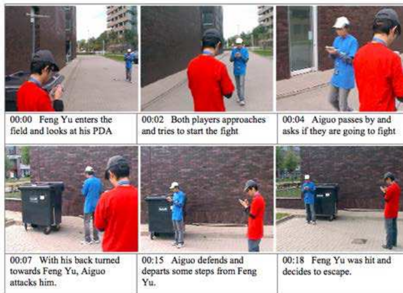
Fig. 2. The Chinese fight

The fight mechanics, a component of the game logic, and of the underlying technology, has been used from both player groups. To conquer a field a player has to move into that field. As soon as an opponent player is within the same field each player has the possibility to decide whether he wants to attack or to flee. To attack the opponent they have to identify their enemy physically and to choose the appropriate virtual symbol of their enemy to start the fight.