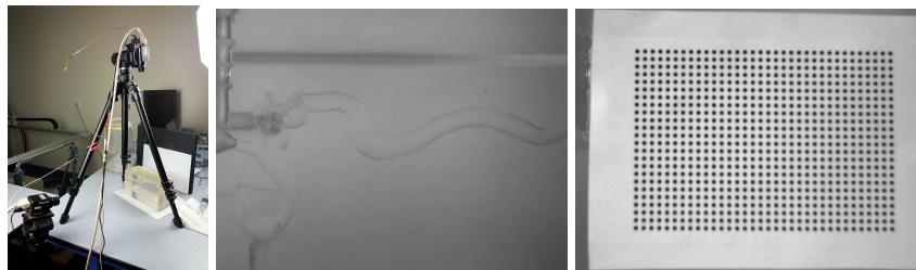
Fig. 2: (left) Experimental setup, showing the top and side camera, observing the silicon vascular phantom; (middle) image of the phantom by the top camera; (right) calibration pattern used to compute the equation of the refractive plane (inter-bullet distance=2 mm)

This test bench is composed of a motorized spool that pulls over one meter of bare electric wire, with a negligible elongation factor and a constant diameter of 1.54mm (close to interventional radiology tools). While the electric wire diameter