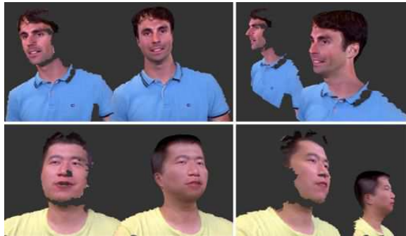
Figure 4: For each image, (left) 3D reconstruction from sensor output, (right) 3D head reconstruction using our method.

Although in our experiments the face tracker provided accurate and reliable results for a wide range of subjects and lighting conditions, it can occasionally fail. When this happens, our method cannot choose the correct head models for the reconstruction and the head model with a neutral face is